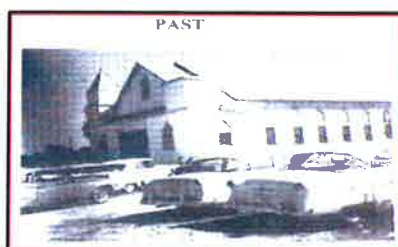
Historic picture of Greater St. James Missionary Baptist Church, Mims, Florida Founded 1904