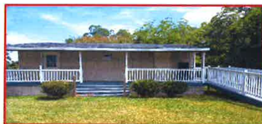
The C.E. Graham Library