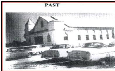
Historic picture of Greater St. James Missionary Baptist Church, Mims, Florida Founded 1904

Currently, Central Christian University of South Carolina holds Candidate Status with the Association for Biblical Higher Education Commission on Accreditation (5850 T.G. Lee Blvd., Ste. 130, Orlando, FL 32822, 407-207-0808.) Candidate Status is a pre-accreditation status granted to those institutions that meet the ABHE Conditions of Eligibility and that possess such qualities as may provide a basis for achieving accreditation statute within five years.