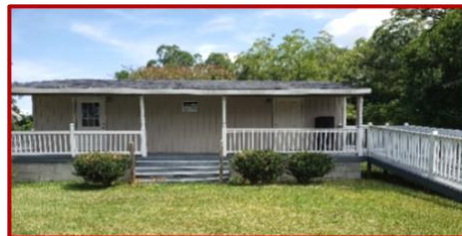
The C.E. Graham Library The New Geographical Location of Central Christian University of South Carolina