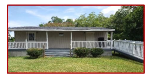
The C.E. Graham Library The New Geographical Location of Central Christian University of South Carolina