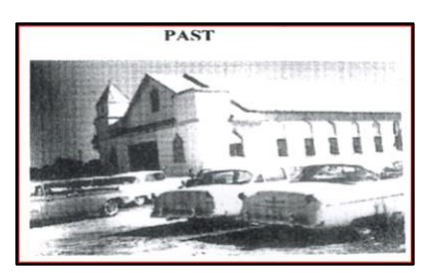
Historic picture of Greater St. James Missionary Baptist Church, Mims, Florida Founded 1904

Currently, Central Christian University of South Carolina holds Candidate Status with the Association for Biblical Higher Education Commission on Accreditation (5850 T.G. Lee Blvd., Ste. 130, Orlando, FL 32822, 407-207-0808.) Candidate Status is a pre-accreditation status granted to those institutions that meet the ABHE Conditions of Eligibility and that possess such qualities as may provide a basis for achieving accreditation statute within five years.